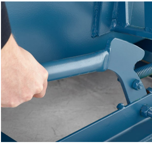
Manual handle operation